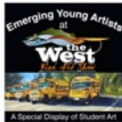
A Special Display of Student Art