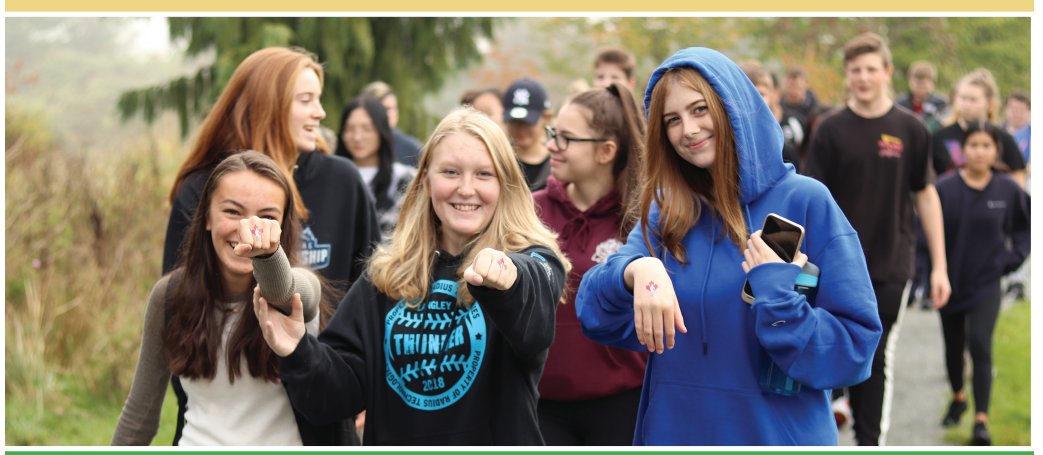
TO CONTRIBUTE TO THE LSS LEGACY FUND TO PROVIDE SCHOLARSHIPS FOR LANGLEY SECONDARY GRADS, MAKE TAX RECEIPTABLE DONATIONS TO THE LANGLEY SCHOOL DISTRICT FOUNDATION. www.langleyschooldistrictfoundation.com

Walk the hallowed halls of the SAINTS for the last time, before most of the original building is torn down this summer to make way for the New Building! All students, teachers, administrators and support staff are welcome to attend the 110th Anniversary of Langley High School and Langley Secondary School. Be there to connect with old friends, teachers, office staff, principals, vice-principals, custodians, coaches, old girlfriends, old boyfriends, the nerds, the cool kids and the jocks. Eleven decades of memories. Don't miss it! SATURDAY, JUNE 8. Activities throughout the day and chances to re-visit your graduating year both virtually and in real-life. See you there or be SQUARE!